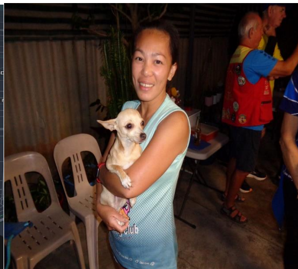
The Hare: Menstrual-Disorder