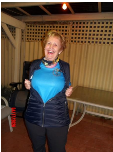
The Hare: Shadow

22 FH3 Harriers attended this week's run – limbered up, showing absolute peak physical fitness and chomping at the bit – all this for a 4km Run ??? around the streets of Stirling.