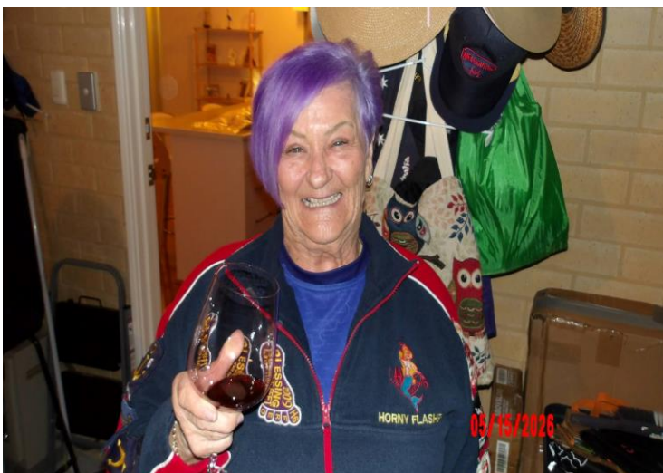
The Hare: GM: Horny Flasher

29 FH3 Harriers attended this week's run – limbered up, as usual showing absolute peak physical fitness - ready to hit the streets of Cannington.