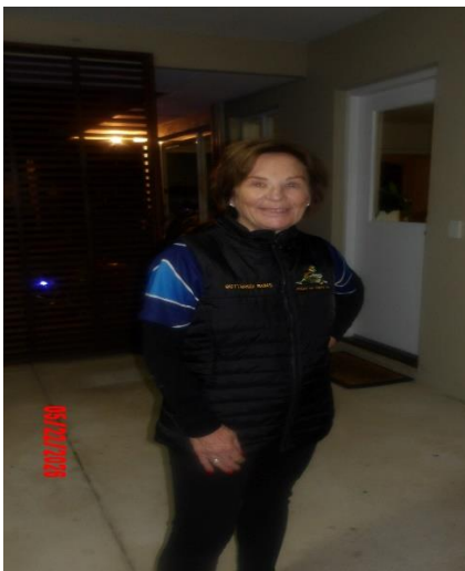
The Hare: Buttered Buns

Exceptions were Biro -limping badly and Ding who only managed to escape from Prison at the last moment.