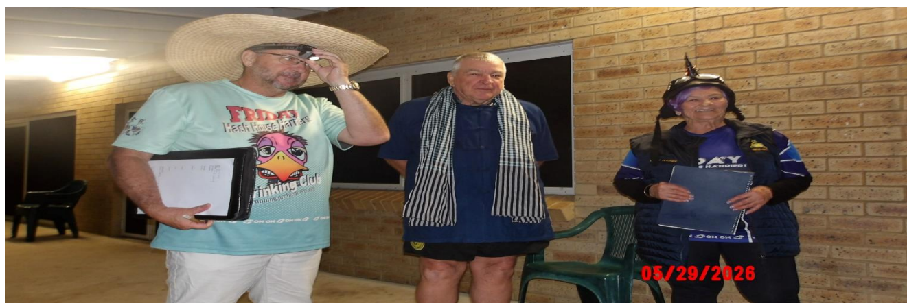
The FH3 On-Sec (Ding), R.A. (Sheep Shunter) and GM (Horny flasher) 2026

QR code for can/glass refundable to go to FH3 - C 10446611