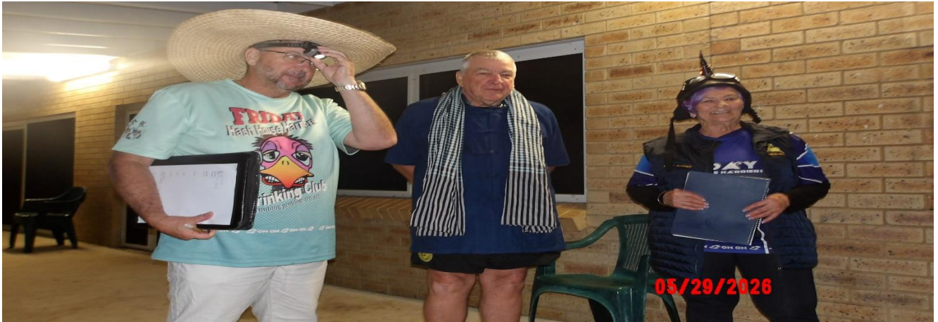
The FH3 On-Sec (Ding), R.A. (Sheep Shunter) and GM (Horny flasher) 2026